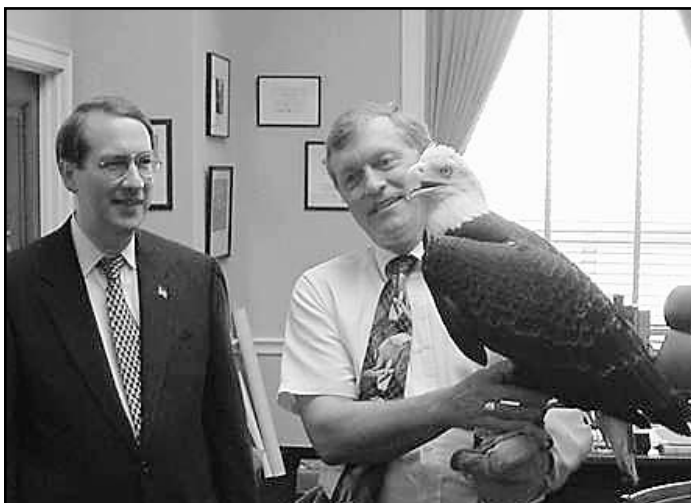
In the Capitol Hill office of U.S. Representative Bob Goodlatte (R-VA)